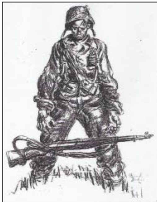
“War's End” by Howard Brodie

part of town. At first, when the locals found out we were going to move in, they blew up the building...so then we got the building next door. As we were moving in, the whole area came out and protested peacefully, waving signs and banners saying they didn't want us there, and that it was their country and that we weren't welcome.... That was